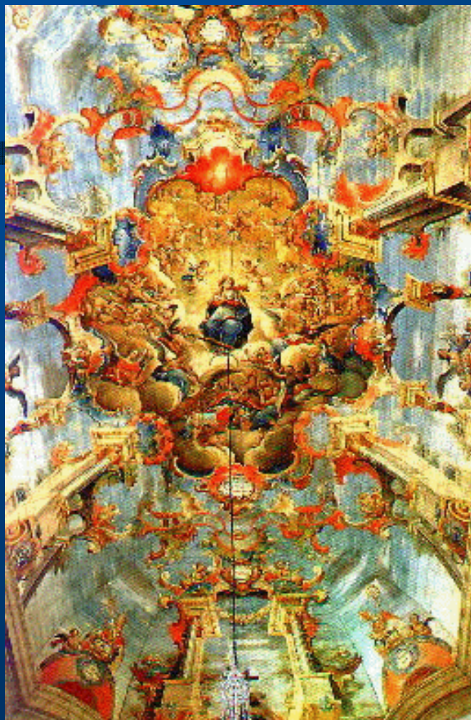
São Francisco Church